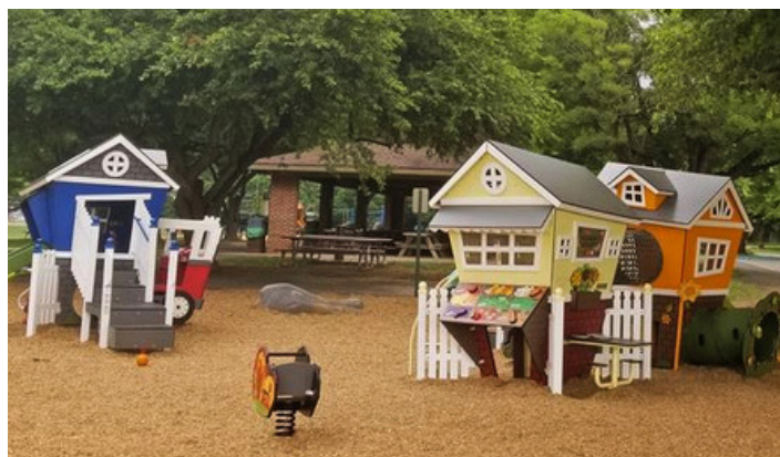
John A. Redding Memorial Park

It is located on S. 2nd Street between the blocks of McKinley and Catherine Street. This park has two full-size lighted basketball courts, a new pavilion that seats approximately 35 people, a large playground structure, shaded picnic areas, restrooms, an asphalt walking path around the park, a multi-purpose grass playing field and and a Splash Pad for the kids to play in. Splash Pad is open Memorial Day to Labor Day.