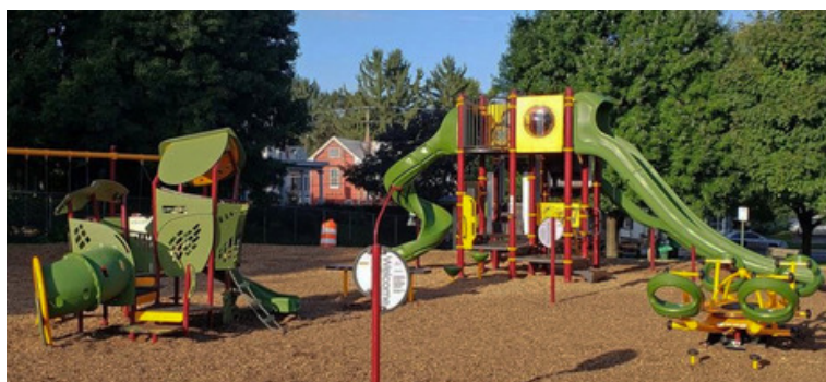
Mike Waters Memorial Park