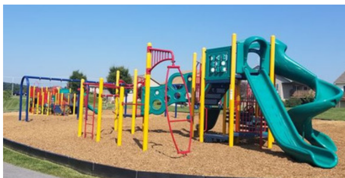
Mill Creek Acres Park

Located off Dump Road, this park offers four acres of open green space along the Conococheague Creek. There is a kayak launch in the park as well as paths leading fisherman or naturalists to the creek. This a great place to hear and see song birds and other wildlife.