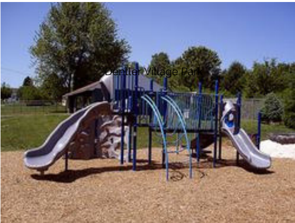
Dentler Village Park

This 50-acre park surrounds historic Dykeman Springs, a National Historic Register landmark. The park consists of three different walking trails, a picnic facility, and a baseball/softball field. The park is open from dawn until dusk. Pets are allowed, but they must be leashed.