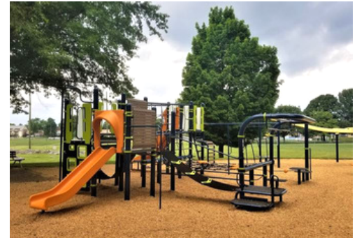
Chambersburg Memorial Park

Located off of Montgomery Alley and Spring Street, you can enjoy the scenic views of the Conococheague Creek, and old water wheel. This park is animal-friendly, one of only two parks in the Borough that allow animals (the other being the Chambersburg Rail Trail, which is adjacent). This park often holds free movies and concerts during summer months.