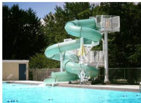
Shippensburg Memorial Park

The park covers twenty acres and includes a public swimming pool, six baseball and softball fields, a soccer field, two basketball courts, four tennis and pickle ball courts, sand volleyball court, playground equipment, a public botanical garden, and three pavilions available to reserve.