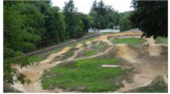
Chambersburg Bike Park

The Chambersburg section of the Cumberland Valley Rail Trail, is a 1.6-mile linear park with opportunities for walking, jogging, biking, dog walking, skateboarding, and rollerblading. Located between Commerce and South Main Streets, the trail encompasses the natural scenic section between Commerce and King Streets (which now includes the Chambersburg Bike Park, which has a Pump Track and a Jump Track for bicycles). The trail passes the Ice Cream Station at Lincoln Way West, crosses the Conococheague Creek, and continues through the South Gate Shopping Plaza to conclude at South Main Street.