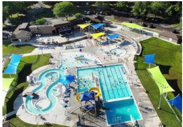
Chambersburg Aquatic Center