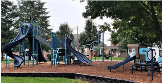
Reservoir Hill Park