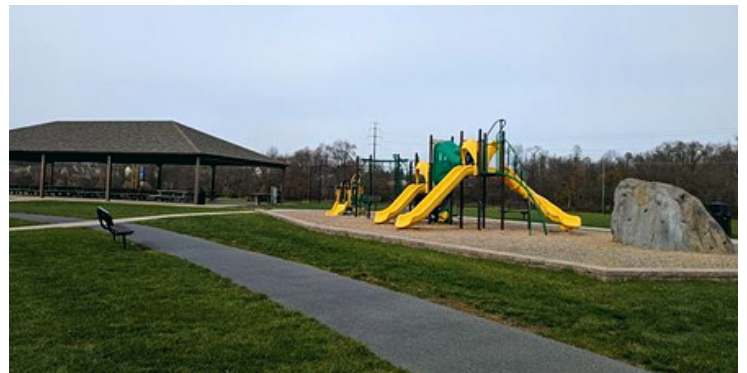
Welty Road Park