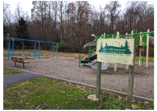
Pine Hill Recreation Area

Top-of-the-line picnic facilities with excellent vista views. Three pavilions grace the landscape, along with a gazebo and two mini-pavilions. Restrooms are also available year-round. A pony league baseball field, softball/little league field and a soccer field are in place for use by local leagues as well as visitors. Other recreational facilities include two state-of-the-art playgrounds, horseshoe pits, and a sand volley ball court.